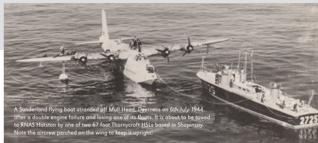
A Sunderland flying boat stranded off Mull Head, Deerness on 6th July 1944 after a double engine failure and losing one of its floats. It is about to be towed by RNAS Hatston by one of two 67 foot Thornycroft HSLs based in Shapinsay. Note the aircrew perched on the wing to keep it upright!

The Plain of Fidge decoy control building is on the roadside by Cata Sand. Built to a standard design, it has an entrance area and a room to either side; one contained the generator which supplied power for the lights, the other acted as a crew room, look-out and air-raid shelter. Additional protection was provided by layers of soil. There are identical remains at Cot-on-Hill, Shapinsay NGR HY 522 169. Both sites were designed to imitate airstrips.