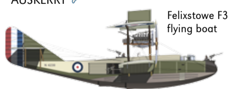
Felixstowe F3 flying boat