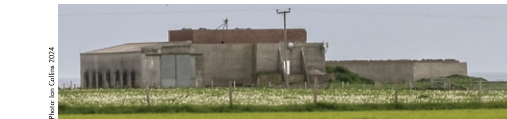
RAF Whale Head standby power station (left). The receiver block (distant, right) had two 73m timber towers nearby.