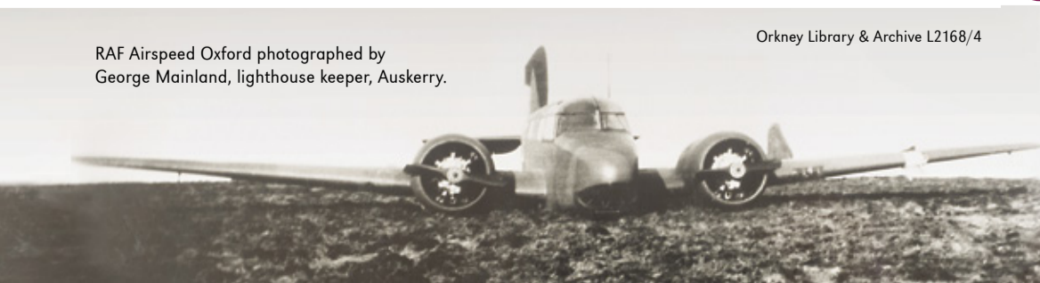
Orkney Library & Archive L2168/4