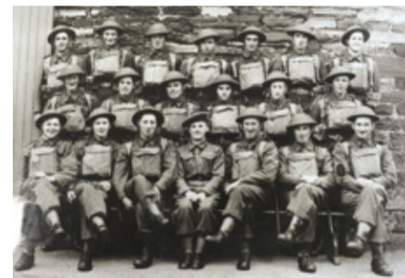
Westray Home Guard during WW2.

The Westray Heritage Centre in Pierowall was opened in 1995 (see back page for information). Dating from c.1853, it was originally a schoolroom. During WW1 it was commandeered to house airmen of the balloon-defence base, created for the protection of the seaplane station. It then served as a village hall until WW2 when it became HQ of Westray Home Guard. Look-out posts were set up at Noup Head lighthouse (core path W2) and in the requisitioned front rooms of islanders' homes. At the end of WW2 the hall was used for 'Welcome Home' parties and dances.