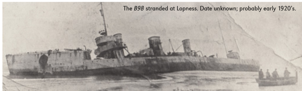
The B98 stranded at Lopness. Date unknown; probably early 1920's.

Information board, picnic spot, beach and car-park. Best seen at a low tide. The impounded SMS B98 was being towed from Scapa Flow to Rosyth for scrapping when she broke loose in stormy weather and was stranded here in February 1920. Most of the ship has been salvaged, though the two steam turbines, drive shafts and parts of the boilers remain visible at low tide.