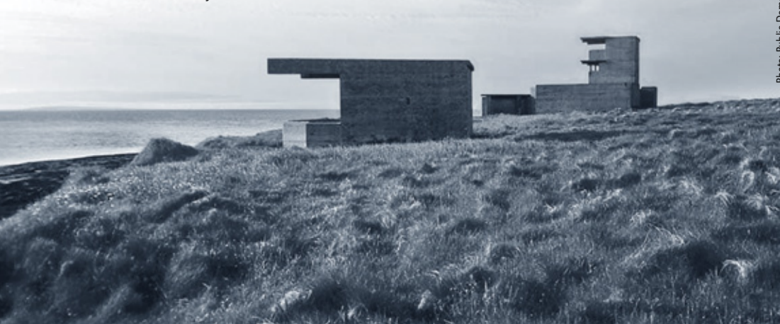
Galtness Coast Battery

After 3.9km the path passes the two open-top gun emplacements of Castle Battery; the one furthest from the path has an adjacent magazine and crew shelter, with the concrete pillar for the rangefinder / director just beyond (once housed in a wooden hut). In the fields either side of the path are the foundations for the accommodation camp that served both sites. Next is an engine (generator) house, a Nissen hut reinforced with concrete; there is another in the field 130m to the SW. At the end of path is Galtness Battery with its director tower, covered gun emplacement, magazine and crew shelter. There are four searchlight emplacements along the shoreline, though coastal erosion is undermining them (KEEP CLEAR).