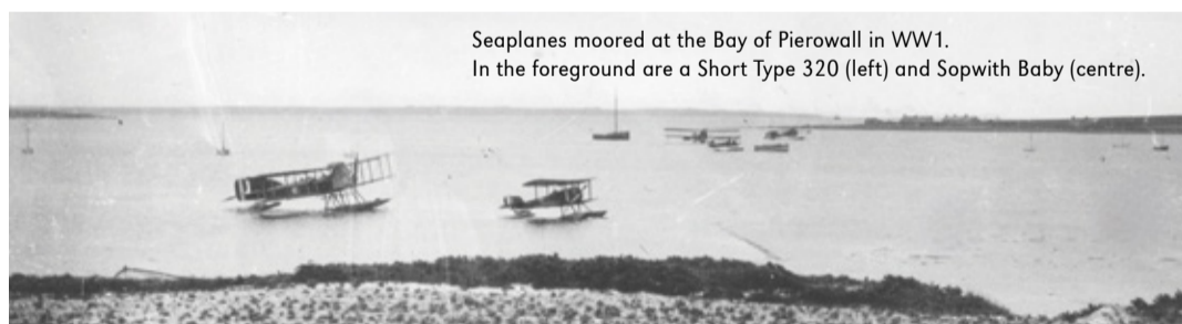
Seaplanes moored at the Bay of Pierowall in WW1. In the foreground are a Short Type 320 (left) and Sopwith Baby (centre).

Core path W3. During 1917-1918 the RAF operated a variety of seaplanes from Pierowall Bay, notably the twin-engine Felixstowe F3 flying boats (below left). Their main role was to hunt for German U-boats (submarines). Personnel were billeted in homes including Pierowall Cottage, opposite the landing stage.